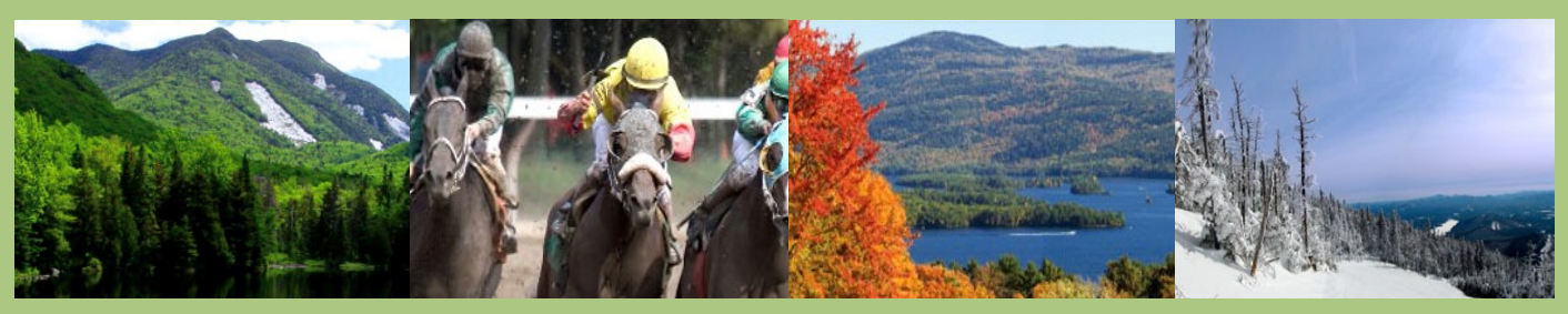
2023 Vol. 13, No. 1